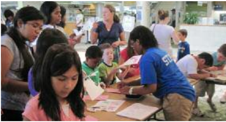
The Foundation's support of the lobby revitalization was appreciated at the Library's Summer Reading Kick-Off Party, which drew hundreds of children and supportive family members.