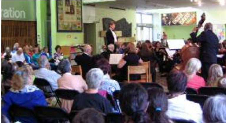
The Library's lobby embraced more than 200 residents as they enjoyed the Westchester Chamber Symphony Orchestra July 3.