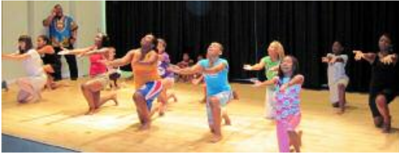
More than 60 teens and tweens enjoyed three summer programs, including African dance and drums, anime and gaming, and jewelry making, in July and August.